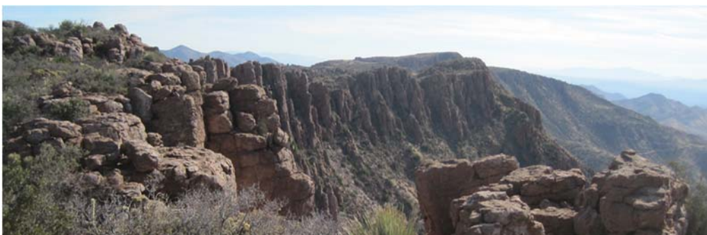
Looking south from the top of Apache Leap